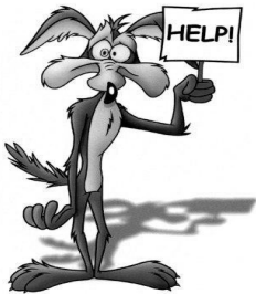
Quad City Expo Center